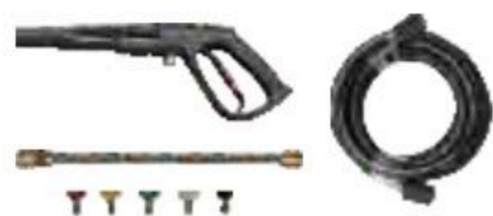
STR 8.714 KM